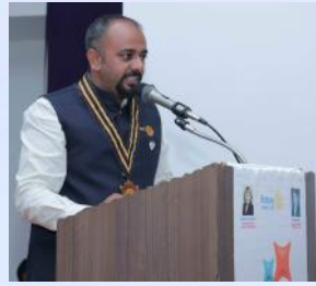
It is an Honor