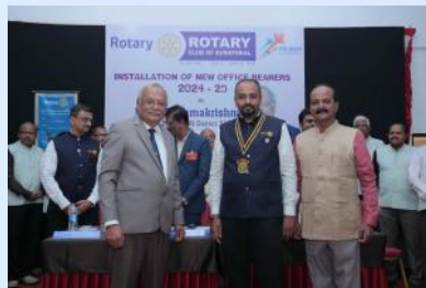
All is yours now