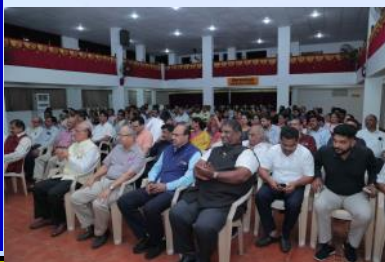
And we all witnessed it