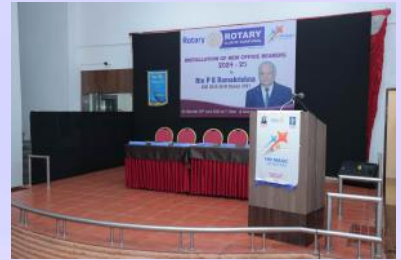
And we are ready