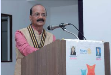
Thank you Rotarians