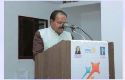
Really, we did so much