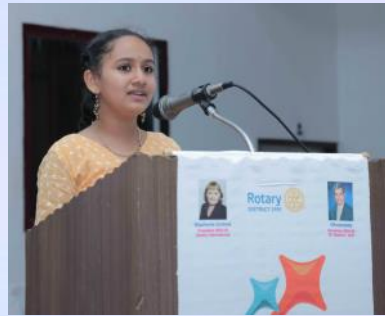
Lord, We seek your blessings